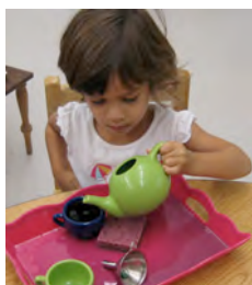
Maya: pouring exercise

In October we focused on autumn traditions and nutrition. The children enjoyed a variety of hands-on activities to celebrate fall, such as leaf rubbing, apple tasting and creating a graph based on their favorites, pumpkin scrubbing and decorating. The children are also learning about food groups and making healthy choices. A favorite science experiment this month consisted of placing burning paper in a bottle to create a "partial vacuum" and pull a hard boiled egg into the bottle.