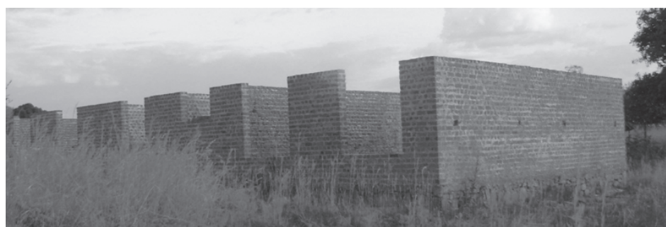
Construction on the Bethlehem Tailors Training Centre